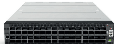
SN5600 switch image